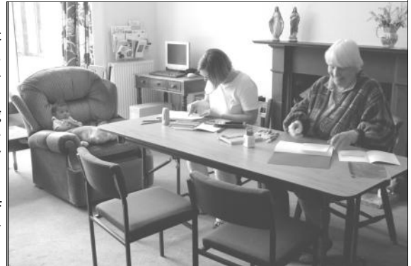
Getting creative: pilgrims at Llangasty

If you have the opportunity in the future please come along, even if only for a couple of days. It is a great way to have 'time out' from our busy lives and to have 'time with' God and our church family.